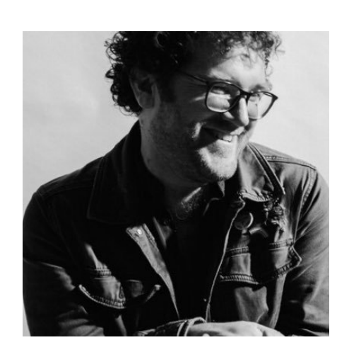
PADRAIG O TUAMA Poet, Northern Ireland